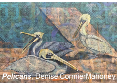
Pelicans -Denise CormierMahoney