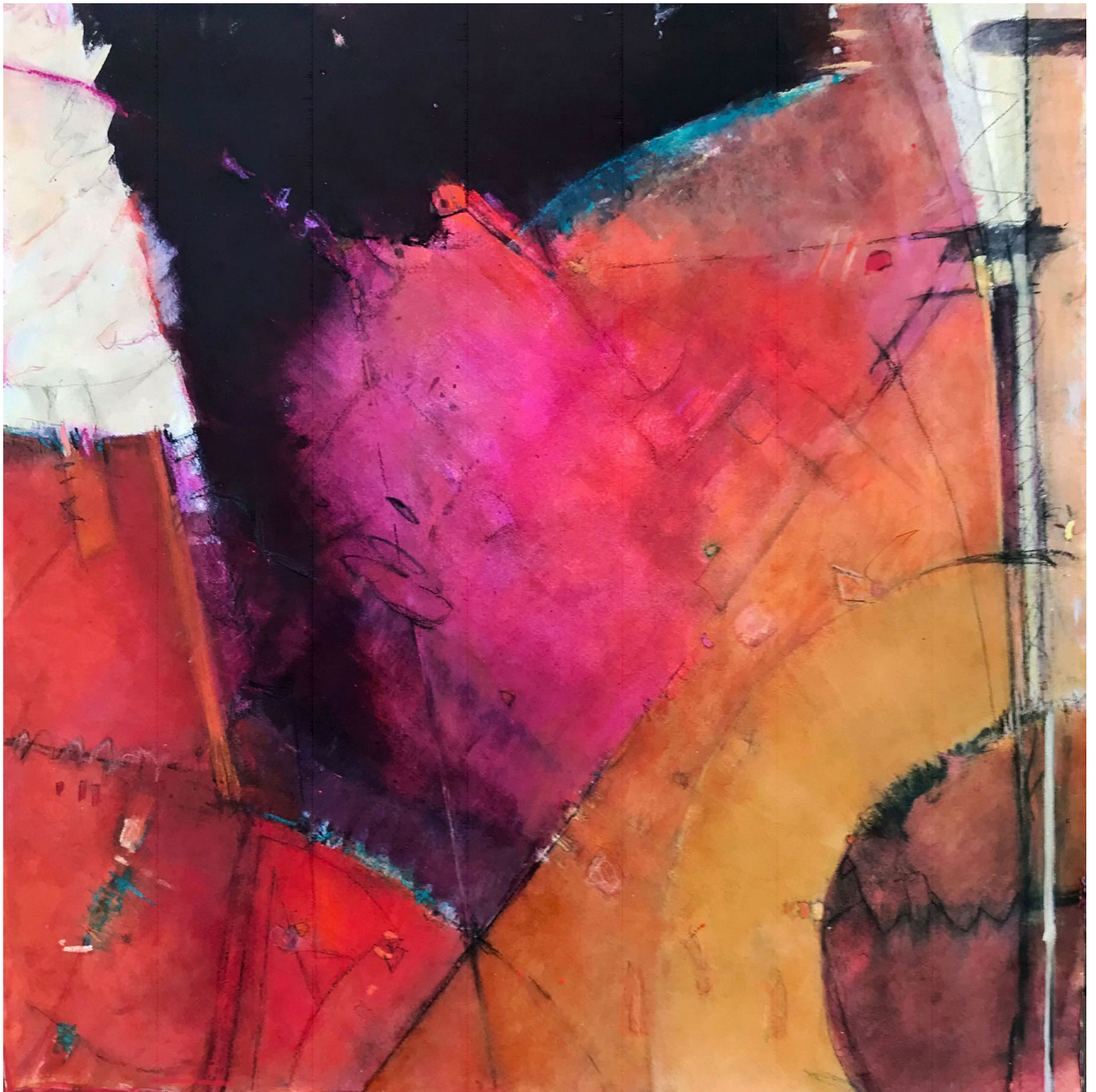
Out of Darkness by Elaine Daily Birnbaum, AWS