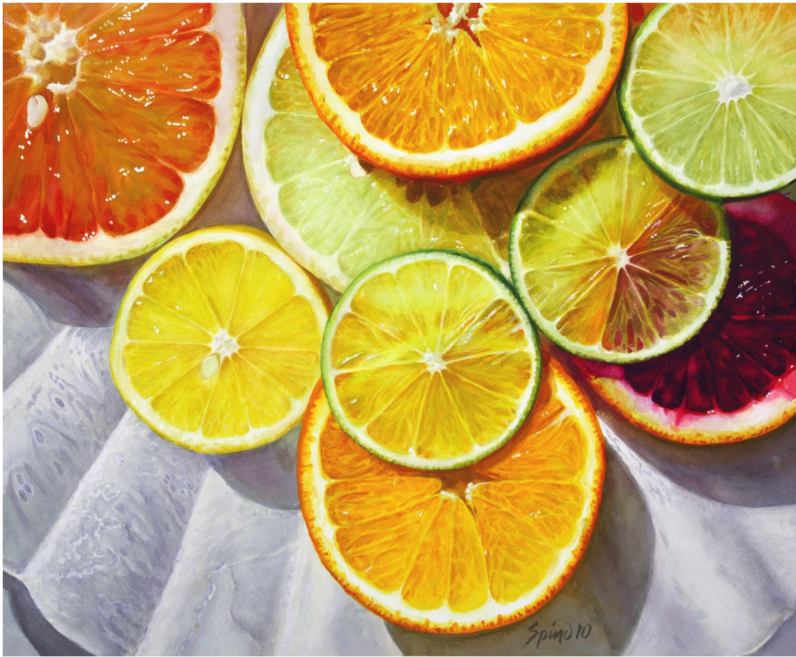
Citrus Smile by Frank Spino