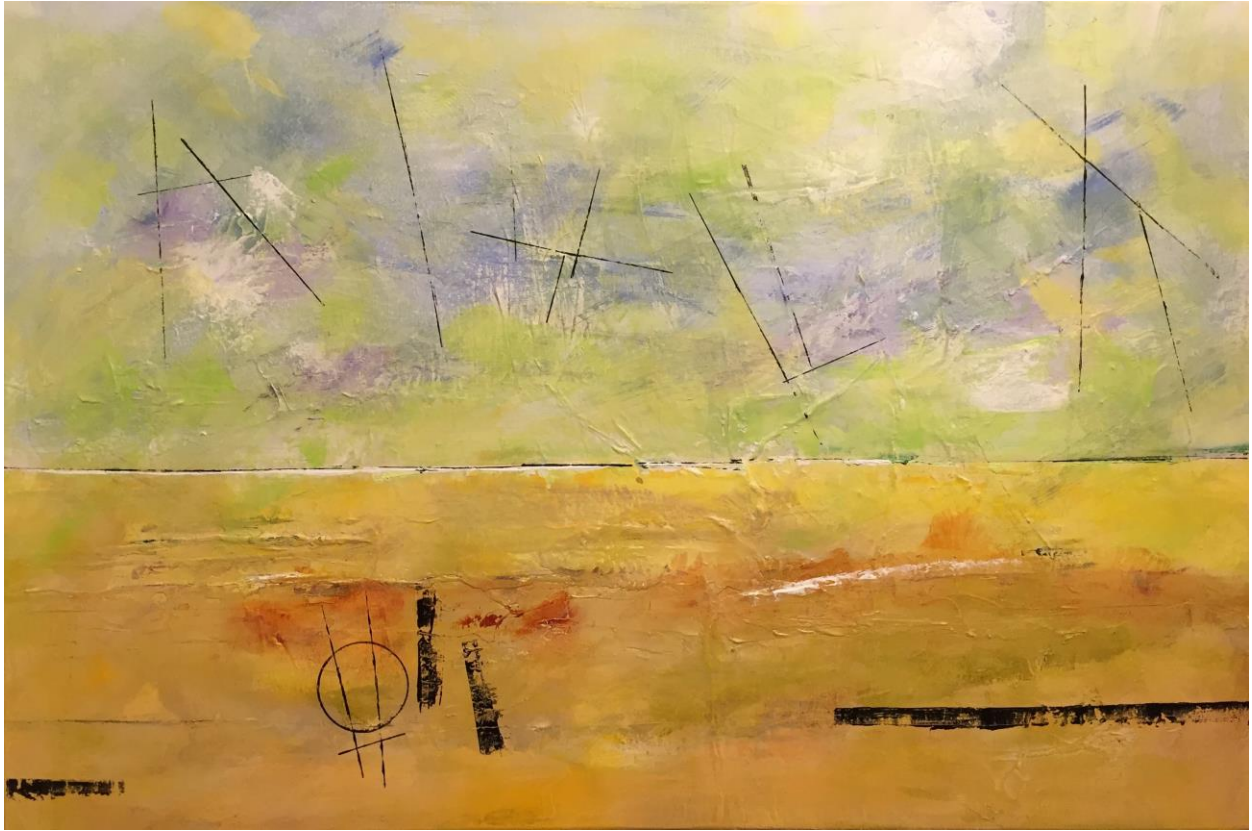
"Field of Dreams" by Cesar Mederios from Splash of Color