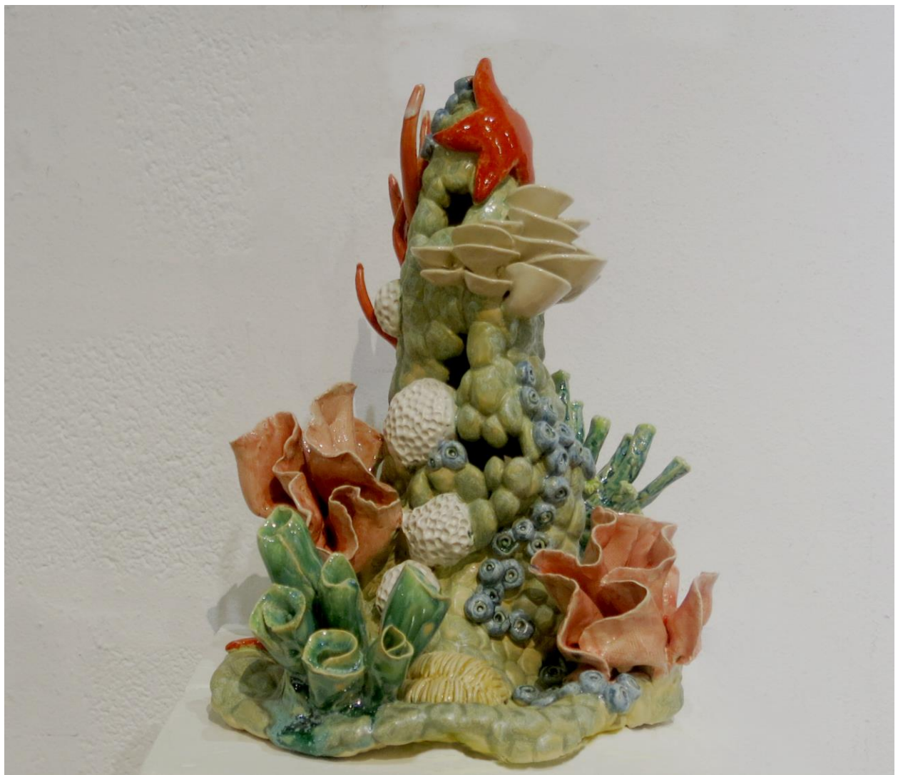
Underwater Cool Down ceramic sculpture by Karen Chilton