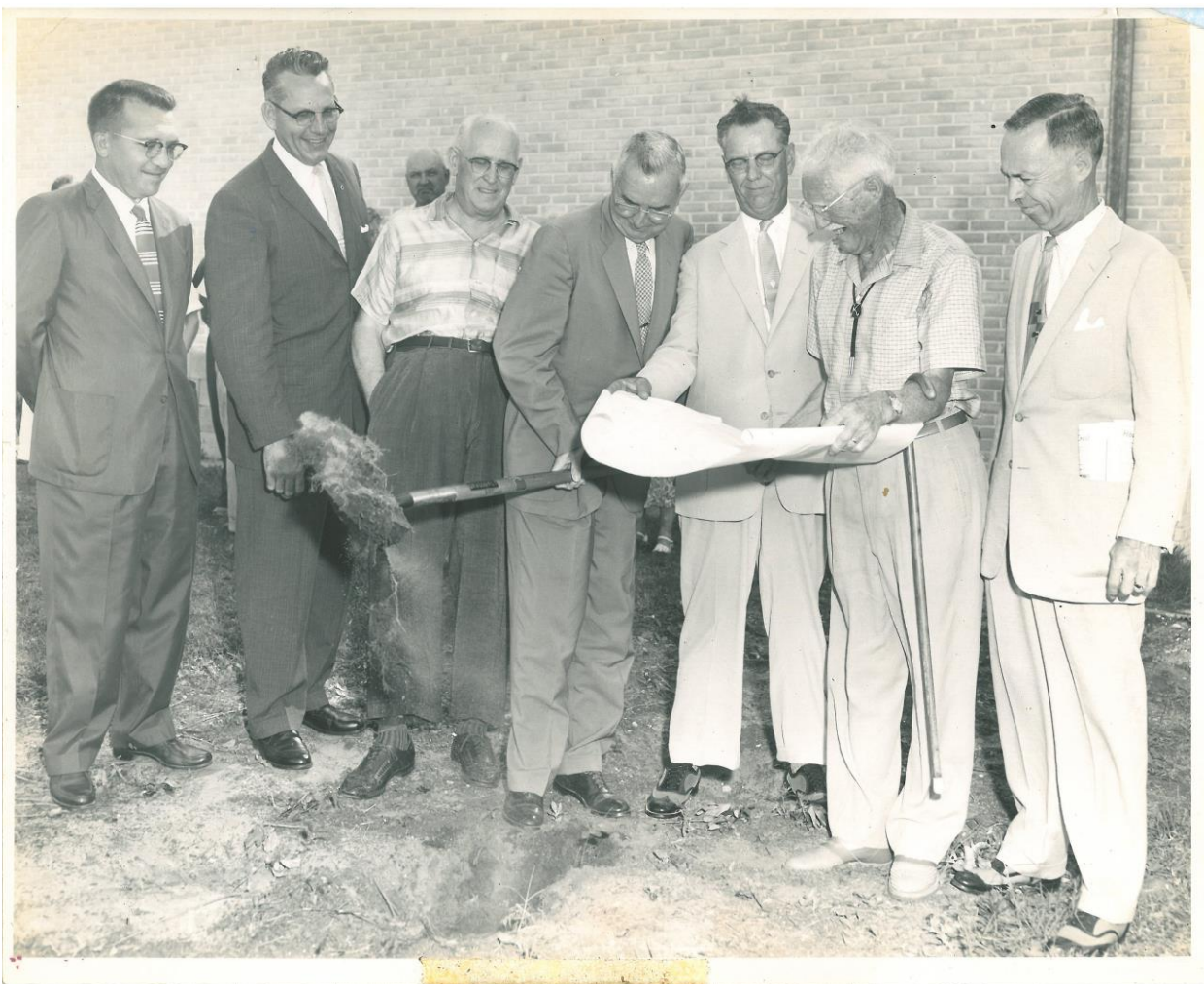
Breaking ground for 9th St building in 1954