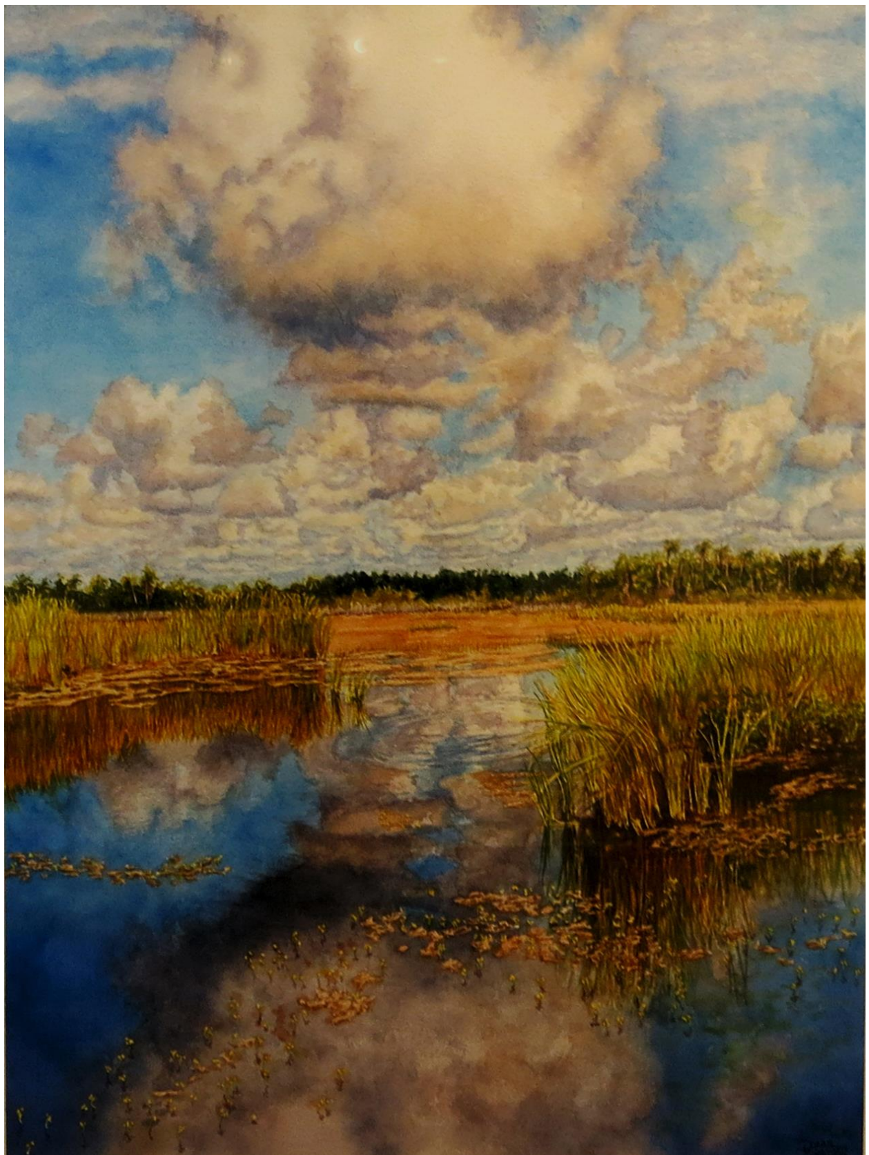
Everglades Reflections #1 watercolor painting by Donna Morrison